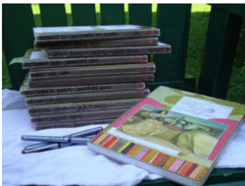
Just a few of my notebooks.